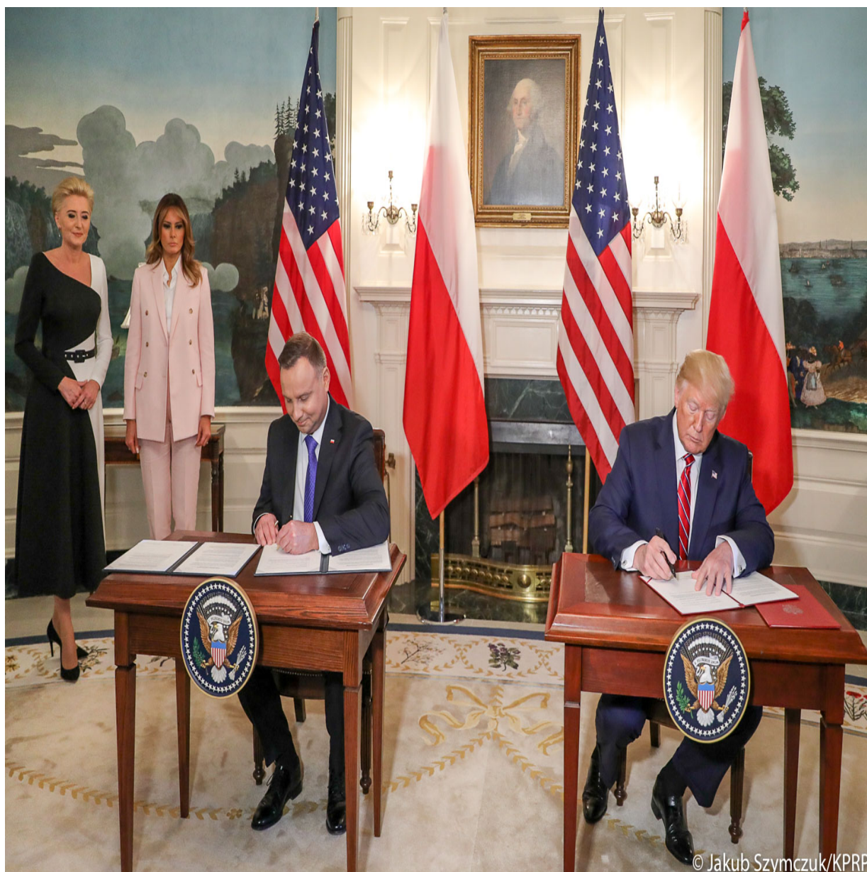
Joint Declaration on Defense Cooperation Regarding U.S. Force Posture in the Republic of Poland

Full text of the Joint Declaration on Defense Cooperation Regarding U.S. Force Posture in the Republic of Poland signed by the Polish and US presidents, Andrzej Duda and Donald Trump.